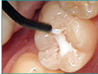
Placing white sealant